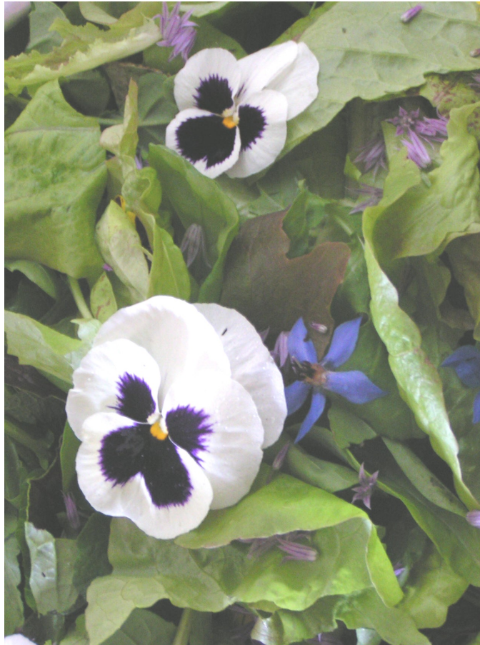
Imagine having this beautiful salad made from farm-fresh greens and edible flowers!