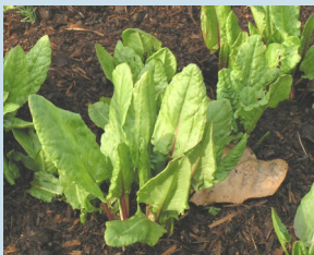
French sorrel is an excellent source of vitamin C.

Buying local, organic produce is better for the environment, too!